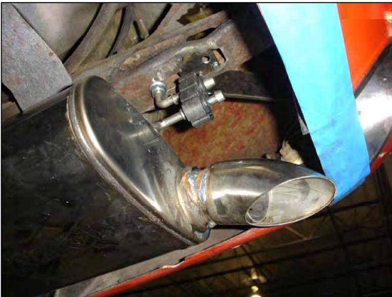
Fig # 2

Step 4: Once a final position has been chosen for the new system, evenly tighten all fasteners from front to rear. The supplied band clamps must be VERY tight to properly align the pipes and prevent leaks (Approximately 65ft-lbs). U-bolt clamps should be tightened to approximately 30-35ft-lbs. Inspect all fasteners after 25-50 miles of operation and retighten if necessary.