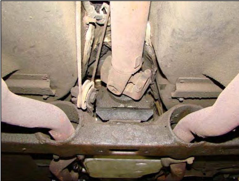
Fig # 1

Step 4: Once a final position has been chosen for the new system, evenly tighten all fasteners from front to rear. The supplied band clamps must be VERY tight to properly align the pipes and prevent leaks (Approximately 65ft-lbs). U-bolt clamps should be tightened to approximately 30-35ft-lbs. Inspect all fasteners after 25-50 miles of operation and retighten if necessary.